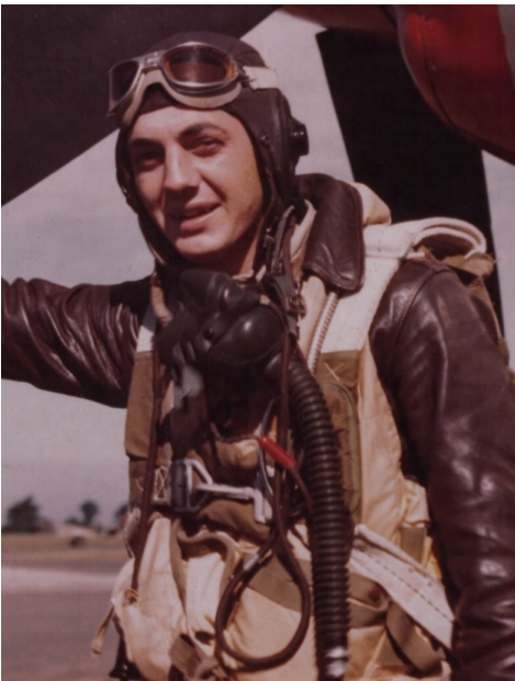
National Archives Photo A 49665